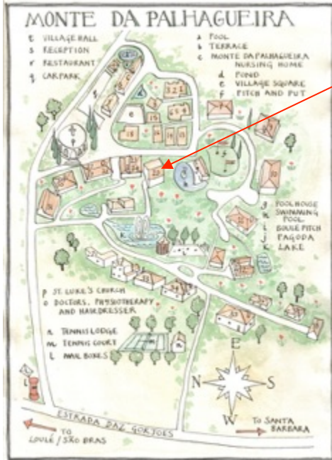
Casa Boa Vista